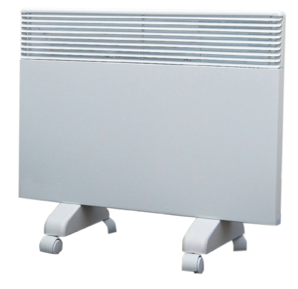
Caster kit for mobile use

Stationary or mobile smart convector with energy-saving features