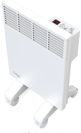
Caster kit for mobile use (optional)

Stationary or mobile convector with energy-saving features