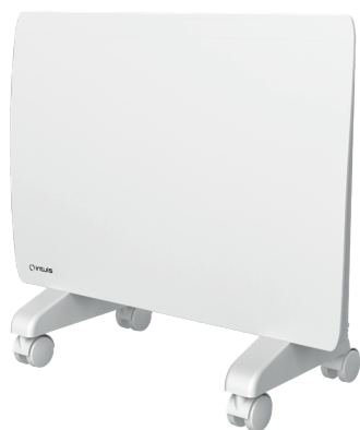
Caster kit for mobile use

The smooth surface disperses heat gently throughout the room.