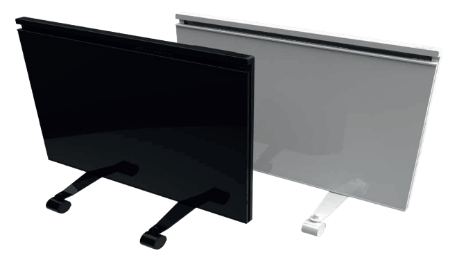
Caster kit for mobile use

Dual emission for a comfortable temperature.