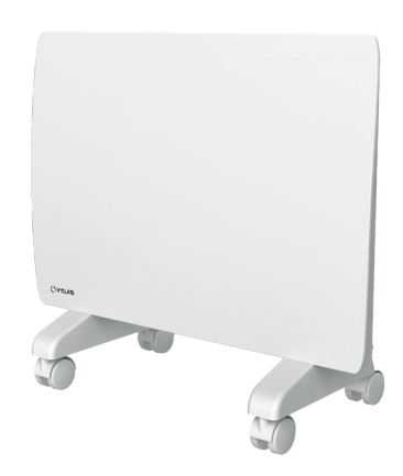
Caster kit for mobile use

The smooth surface disperses heat gently throughout the room.